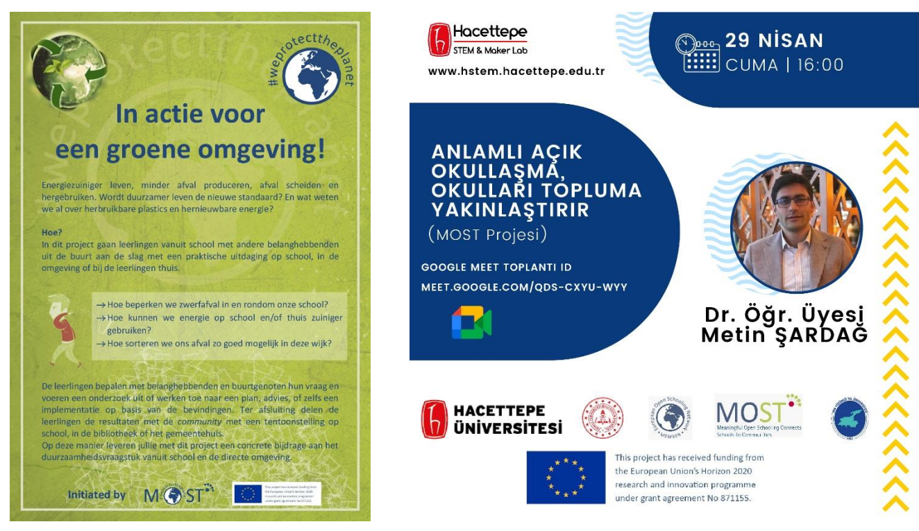
Fig. 5: Example from the Netherlands (left) and from Turkey (right) of an invitation to participate at the MOST project

Anyone who has a certain level of interest in Responsible Research and Innovation (RRI) and actively advocates sustainable development can participate in an SCP. As the SCP leader, you should make sure that you schedule the dates for any meetings so that as many people from the community as possible can participate (for example, pay attention to ordinary working hours). Further, it can be helpful to set up a rough timeline for the duration of the project, so that everyone who is involved can see if it is even possible to participate.