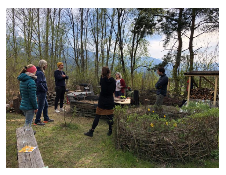
Fig. 8: Launch Workshop with co-creation aspects "Community Garden"

"To facilitate co-creation, you need to understand the process; you need to have a good sense of the steps to take to be co-creative in the entire undertaking. On top of it is useful to have plenty of tools and methods in your back pocket that can help you host that process" (WAAG Society).